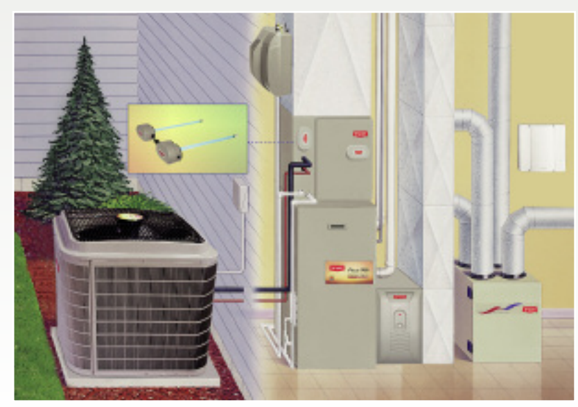
Air Conditioner and Gas Furnace System