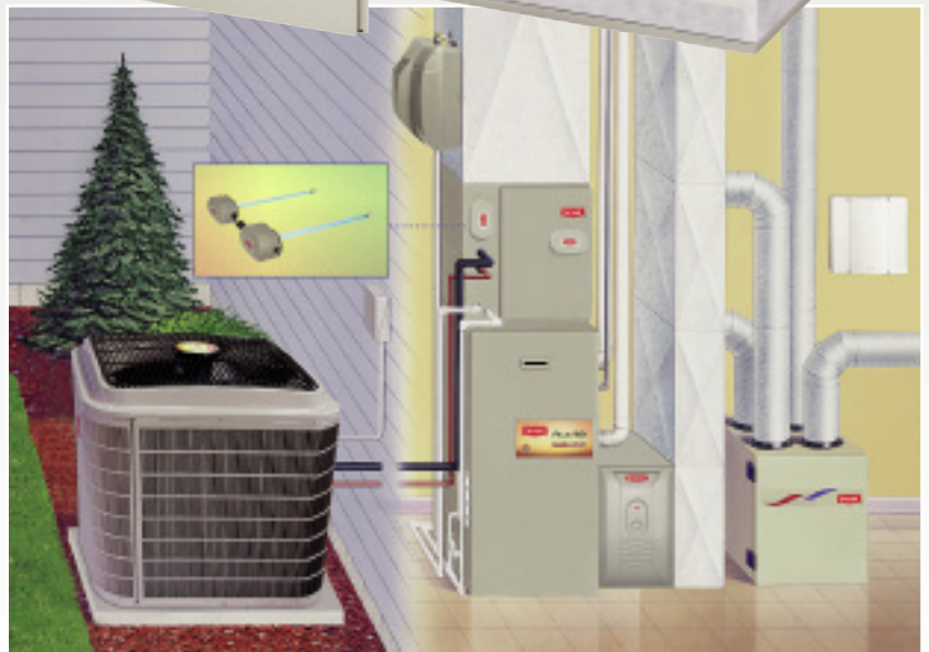
Air Conditioner and Gas Furnace System (Plus 90i shown)