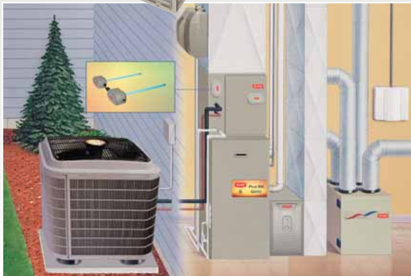
HYBRID HEAT™ Deluxe Heat Pump and Deluxe Gas Furnace System